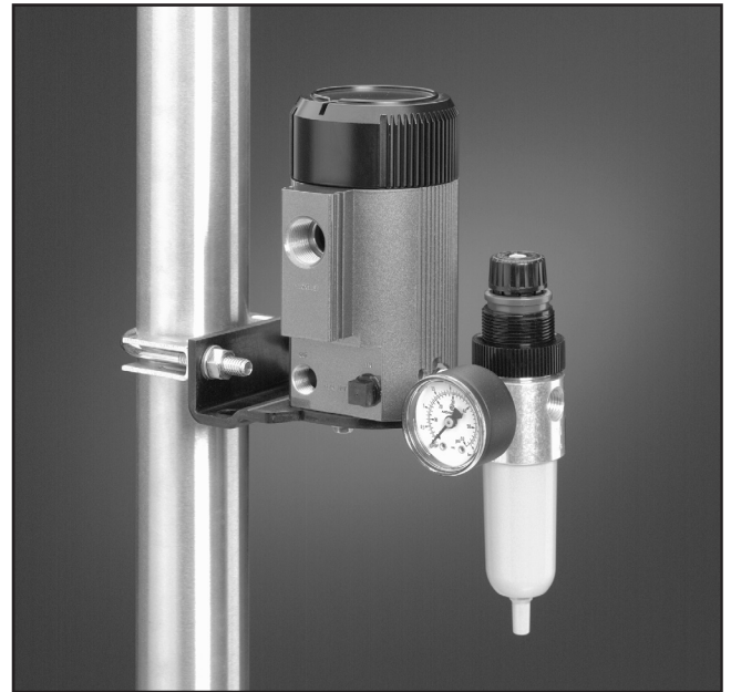
Exceptionally compact, the IPH's versatile mounting bracket provides quick installation, in any position (vertical or horizontal), on a surface or a 2-inch pipe.

The IPH is available with an optional coalescing filter/regulator that combines an air filter and miniature supply line regulator with a pressure gauge that reads in both psi (0-60) and Bars (0-4).